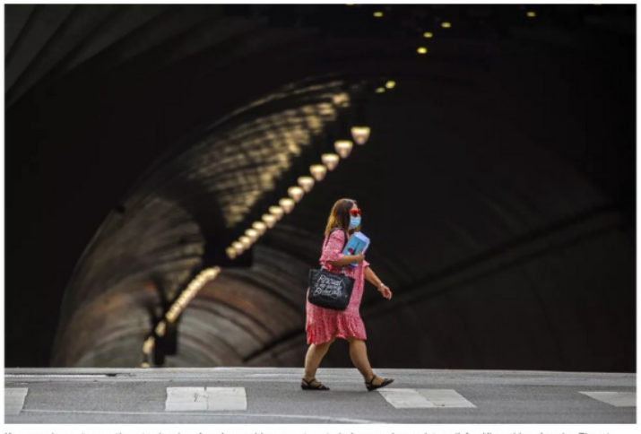
If coronavirus rates continue to rise, Los Angeles could see a return to indoor mask mandates.

L.A. County facing a full-blown coronavirus surge as cases double, deaths rise